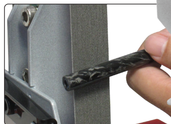
▲ Tip prepping. Shaft tip rides between gap and belt for easy control.