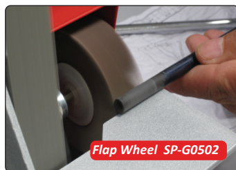
▲ Flap wheel removes thin film coatings off graphite shafts